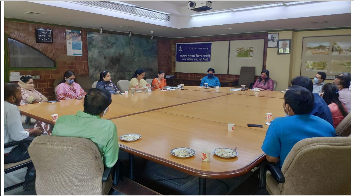
Raj Bhasha Month celebrated in the month of September 2020

With a view to encourage use of official language and provide a forum for the employees to express their creative talent, the Commission launched a periodical titled 'Kalakriti'.