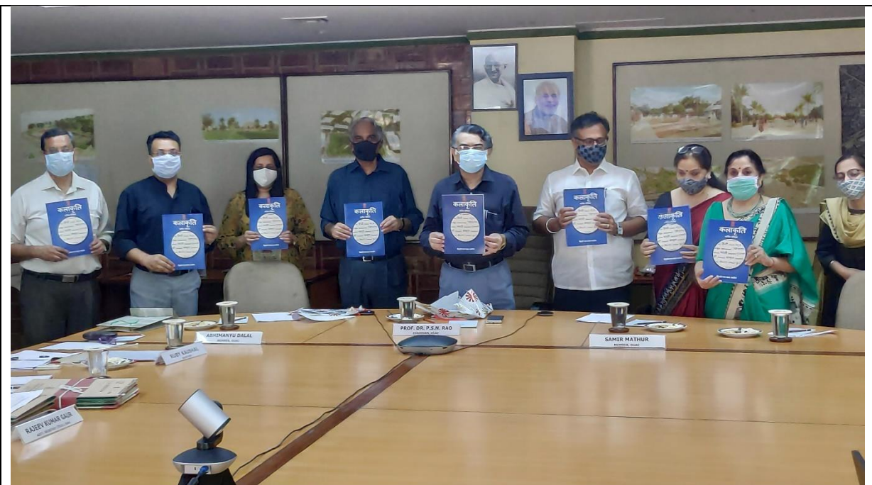
Launching of Third Edition of Hindi periodical 'Kalakriti'

With a view to encourage use of official language and provide a forum for the employees to express their creative talent, the Commission launched a periodical titled 'Kalakriti'.