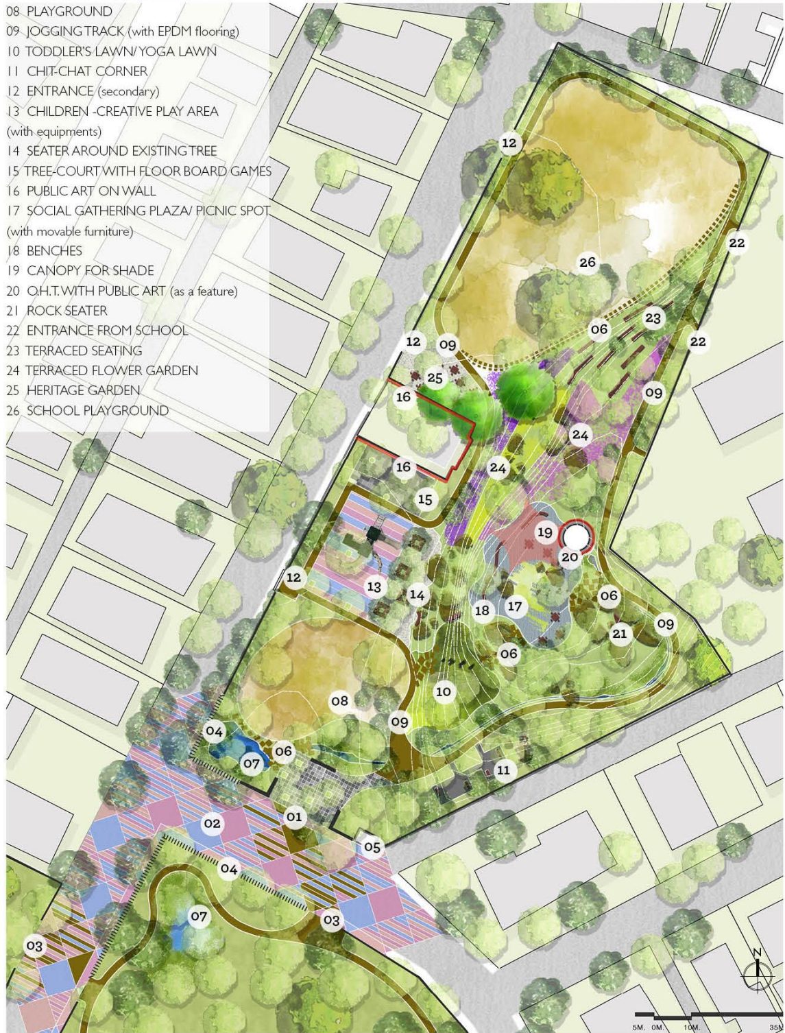
Map 3.7 | Conceptual Landscape Design for Taekwondo Park | Option 01