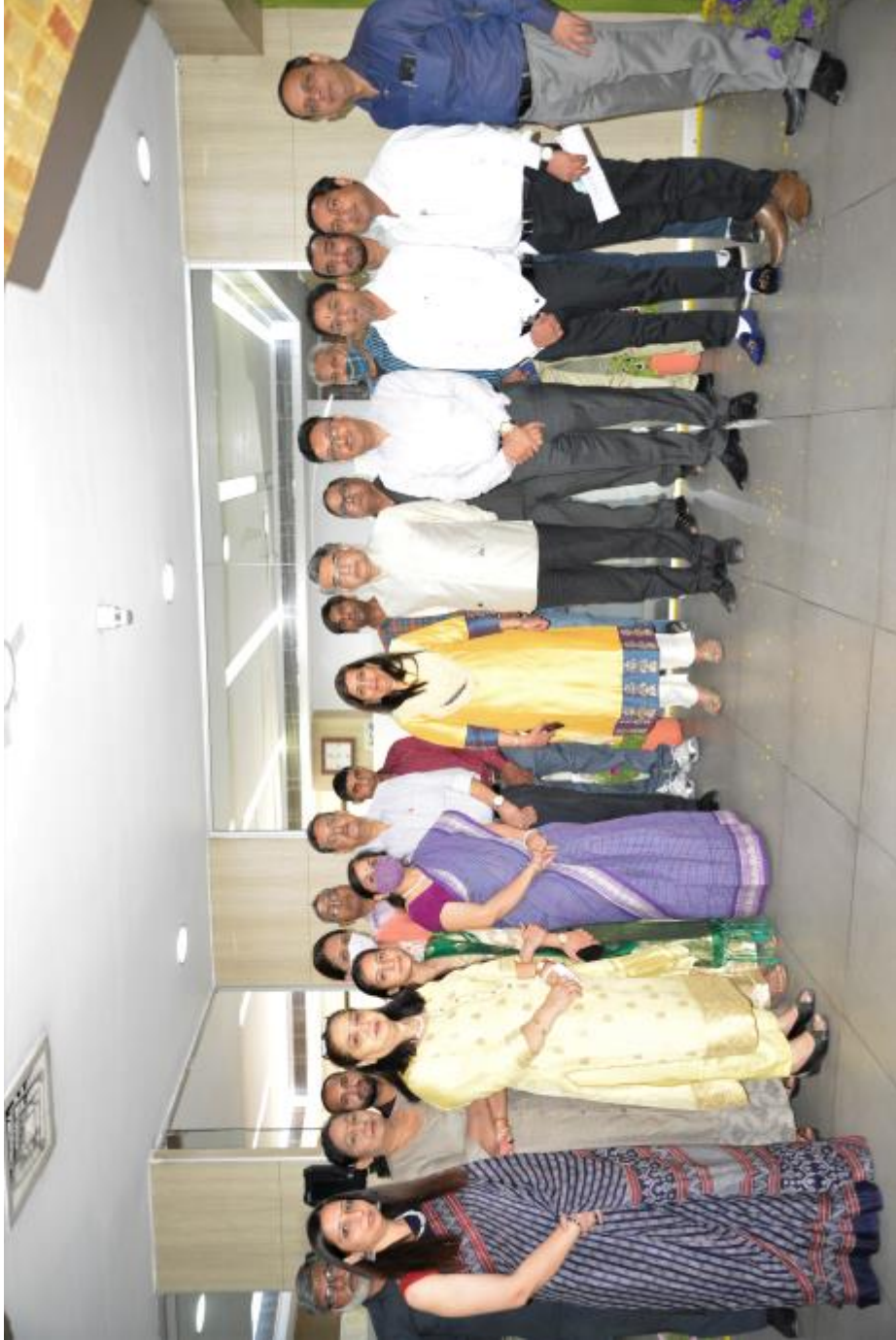
DUAC Secretariat staff with Chairman